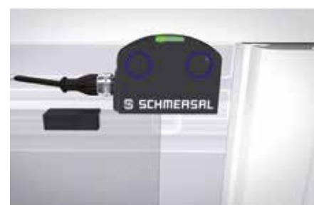
RST-U-2 Sliding door: Smallest size, embedded in Plexiglas