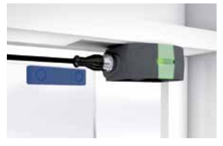
RST16-1 Plexiglas door: flat design, discreet appearance