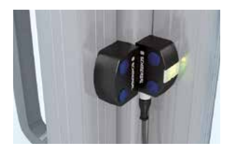
RST260-1 Swivel door with frame, no interfering contour of the door cutout