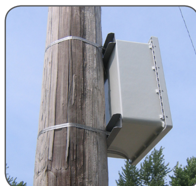
Pole mount brackets fit securely to round, square, or rectangular pole