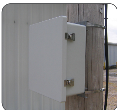
Pole mount kits fit a variety of enclosure sizes to fit your application