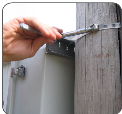
Pole mount brackets secured with wire and screw clamp

The Pole Mount Kit offers a unique solution with feature rich components to aid in hanging and mounting your enclosure on your specific application. Here are just a few of those features: