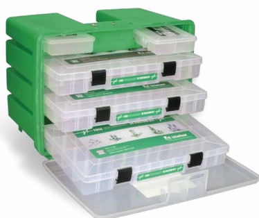
FRCK-OG & FRCK-LG