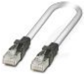
Patch cable, CAT5, assembled, 5 m

Patch cable - FL CAT5 PATCH 5,0 - 2832580