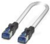
Patch cable, CAT6, pre-assembled, 12.5 m

Patch cable - FL CAT6 PATCH 12,5 - 2891369