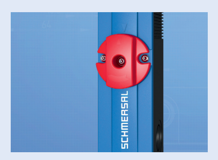
Manual release, emergency exit or emergency release