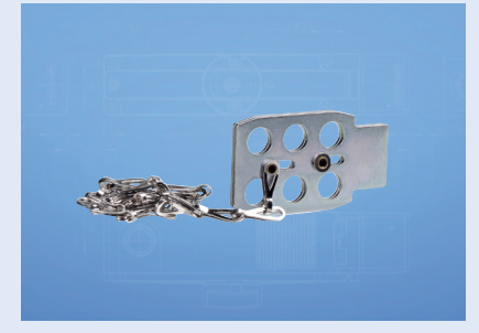
Lockout tag SZ150-1 To prevent inadvertent closing, e.g. during maintenance