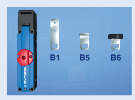
Actuators for all mounting situations B1 (straight), B5 (angled), B6 (flexible)

Solutions for a broad range of applications