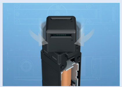
Rotating actuator head Actuator head can be rotated without loosening of screws