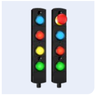
BDF40 Control panel with or without emergency stop