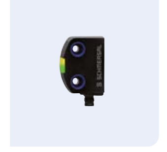
RSS260 Safety sensor