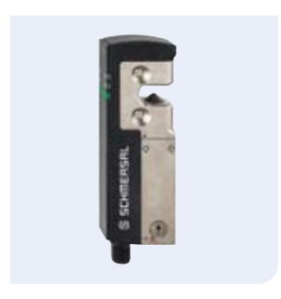
AZM40 Solenoid interlock