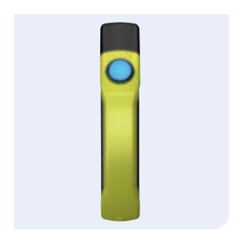
DHS-U1 Door handle