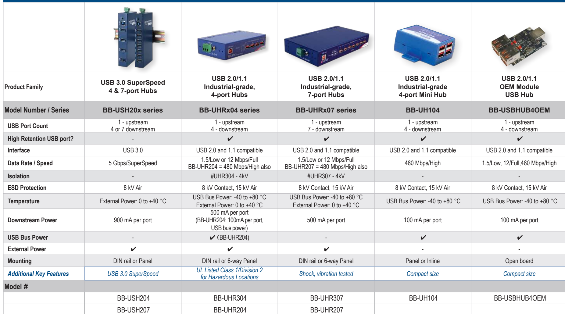
USB HUBS - SELECTION TABLE

Forget about annoying cable disconnections due to vibration. Advantech designs high-retention Type B USB port connectors into most USB products. These orange color high retention ports are 50% stronger than conventional ones, so they hold on tight to standard off-the-shelf USB cable connections. The interface meets Class I/Division 2 minimum withdrawal requirements of 15N. Look for the orange port – you can rest assured your USB connections will hold together in demanding applications.