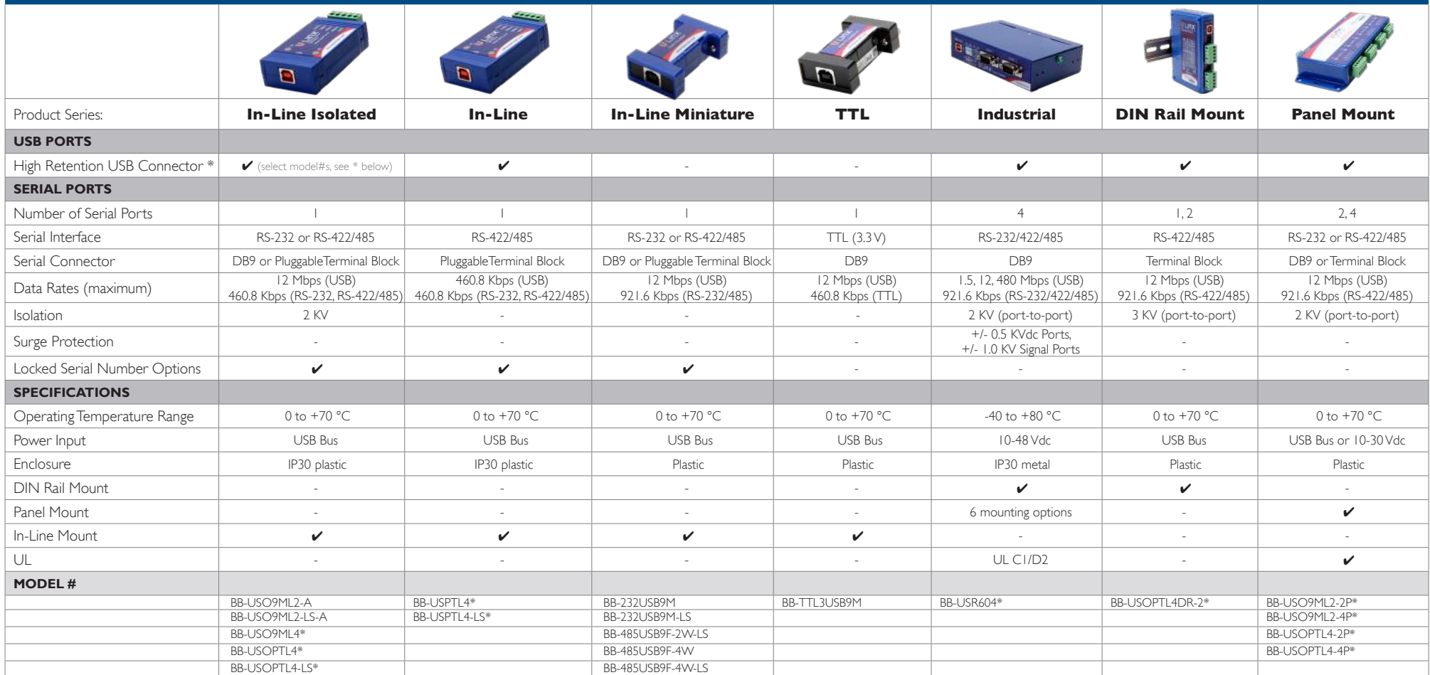
USB TO SERIAL SELECTION TABLE

Now you can forget about annoying cable disconnections due to vibration. Advantech designs high-retention Type B USB port connectors into most USB products. These orange color high retention ports are 50% stronger than conventional ones, so they hold on tight to standard off-the-shelf USB cable connections. The interface meets Class I/Division 2 minimum withdrawal requirements of 15N. Look for the orange port – you can rest assured your USB connections will hold together in demanding applications.